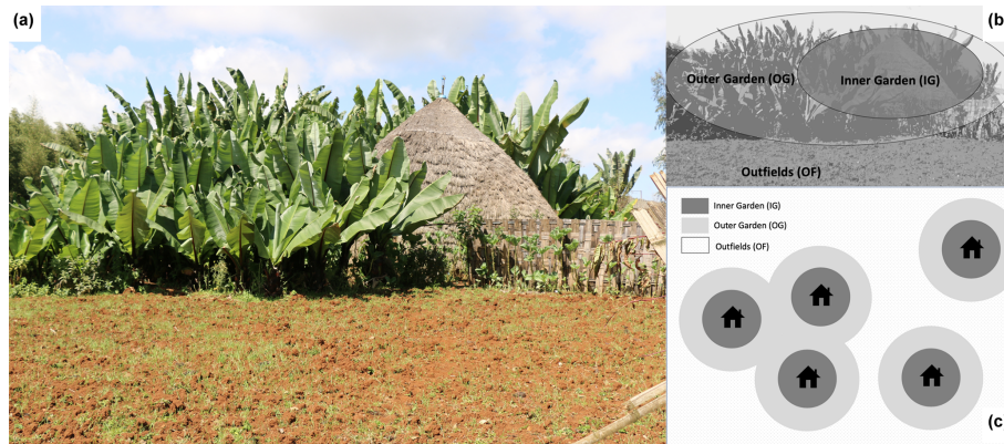
Figure 1. (a) Typical enset-based farm in the Gamo highlands surrounding a traditional hut. (b) Illustration of the different farm zones. The area closest to the house is called the inner garden (IG) and receives more organic inputs, while the remaining part of enset garden (outer garden – OG) receives fewer organic inputs. The garden is often surrounded by a plot devoted to the cultivation of annuals that are fertilized mainly with chemical fertilizer (outfield – OF). (c) Schematic illustration of the spatial arrangement of enset gardens in a landscape. In more densely populated areas, gardens are closer together and may not have outfields.

symptomatic plants from the most common enset variety (locally named maze or mazia; enset varieties do not have standardized names) were present in the inner and the outer garden. This was the case for 19 of the 40 gardens in the subset (two samples per garden, i.e. 38 samples in total). For the second set, leaf samples from 20 pairs of symptomatic and non-symptomatic plants, each pair belonging to the same garden and variety (total of 40 samples), were sampled in 12 gardens. Finally, additional leaf samples of non-symptomatic plants were collected from a range of local varieties (locally named maze or mazia, chamo, checho, falake, geena, katame, katise, kunka, phello and sorgho) to expand the data set on non-symptomatic plants to 218 samples from 58 gardens (Table S1 provides a summary).